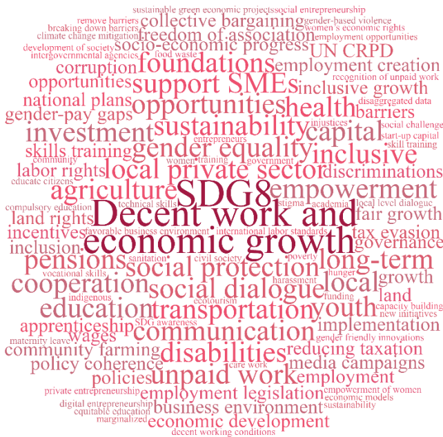
Figure 2 - Word cloud for SDG 8 inputs

The government to community level awareness of the SDGs was reported as lacking. Inputs called for decentralization of development resourcing and financing to more effectively reach the local level as well as to promote local level dialogues to improve cooperation between all levels of governance.