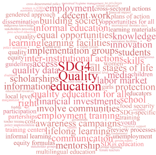
Figure 1 - Word Cloud for SDG 4 inputs

and their targets because knowledge and skills are fundamental for people to understand and achieve Agenda 2030.