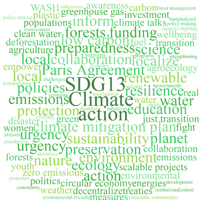
Figure 4 - Word cloud for inputs on SDG 13

Other aspects pointed out include helping the youth understand the challenges of climate change and have a voice; empowering people to take climate action and, especially, making everyone understand that they can also fight against climate change with everyday actions.